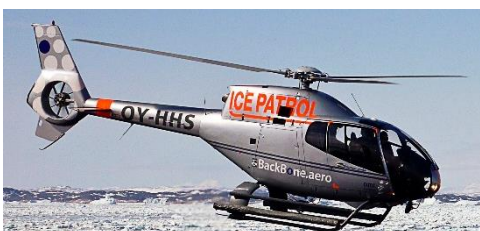
Simon Callesen Type Rating in EC120

We didn't have a photograph of Simon in action so have included a picture of the helicopter he will be flying on his return to Scandinavia